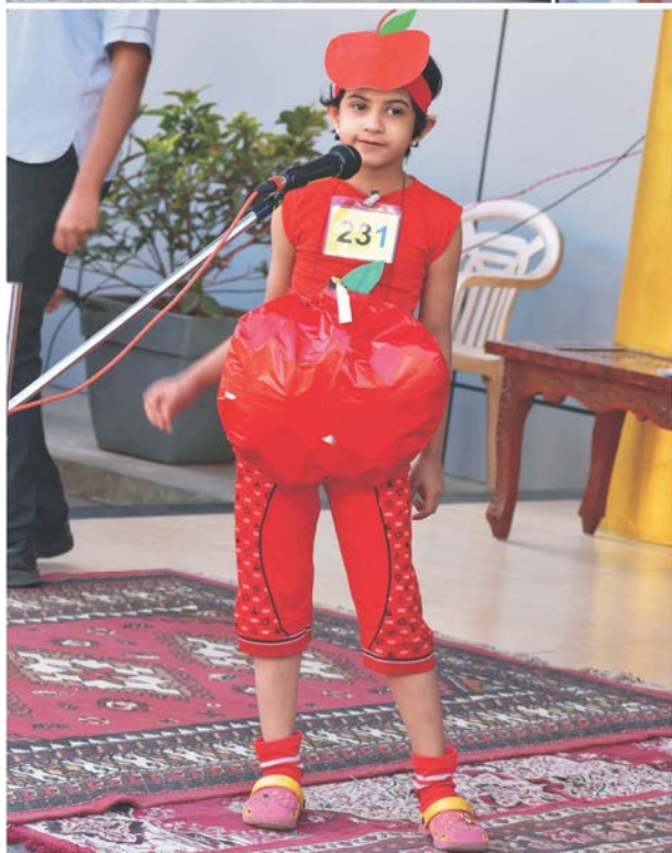
kids fest 2019

blocking the drainage systems. They would just gather at the sewage blocking the flow of water. When floods storm the cities, plastic bags were found to aggravate the disasters by locking up the flood waters. As the plastic bags take centuries to degenerate they slowly break into synthetic granules. The soil containing the carry bags would certainly be polluted. Besides, the granules would get mixed with ground water. The plants would grow on such land and the animals would feed on such plants.