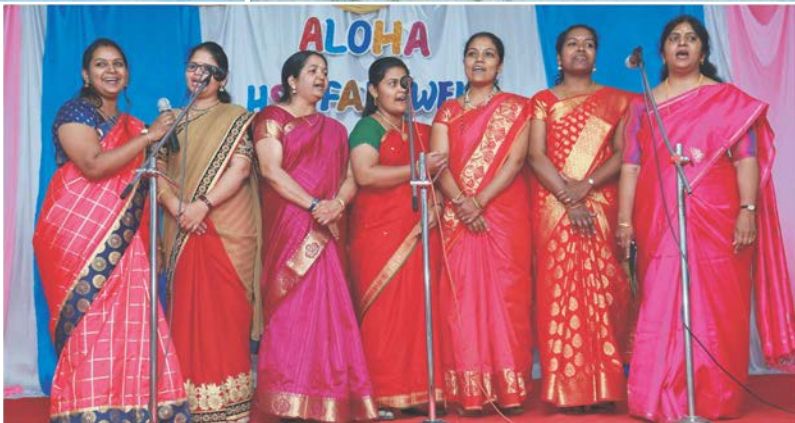
Farewell to Class - XII