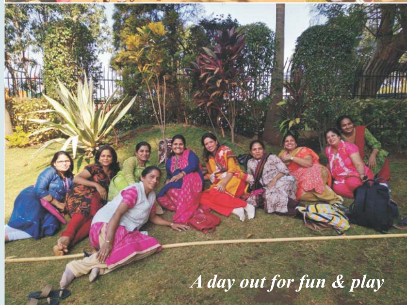
A day out for fun & play